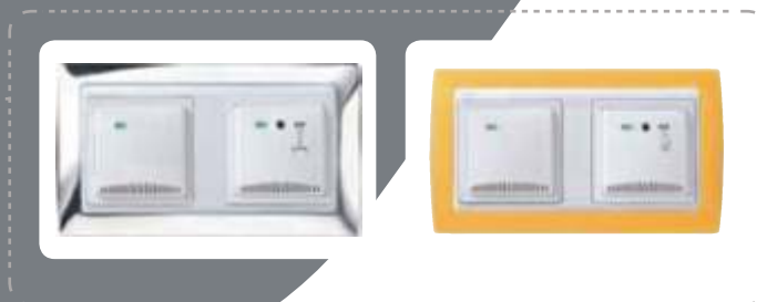
Flood detector with power source