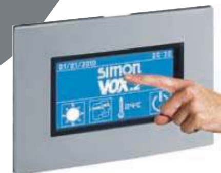
Easy to use

SIMON VOX.2 adapts itself to any type of home, whether newly constructed, or whether under renovation. Thanks to the use of radio frequency units, you can upgrade or modify, according to your taste, without the need to carry out any works or changes.