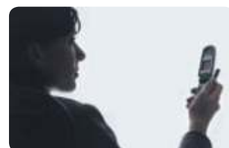
Remote Control/ Telemangement